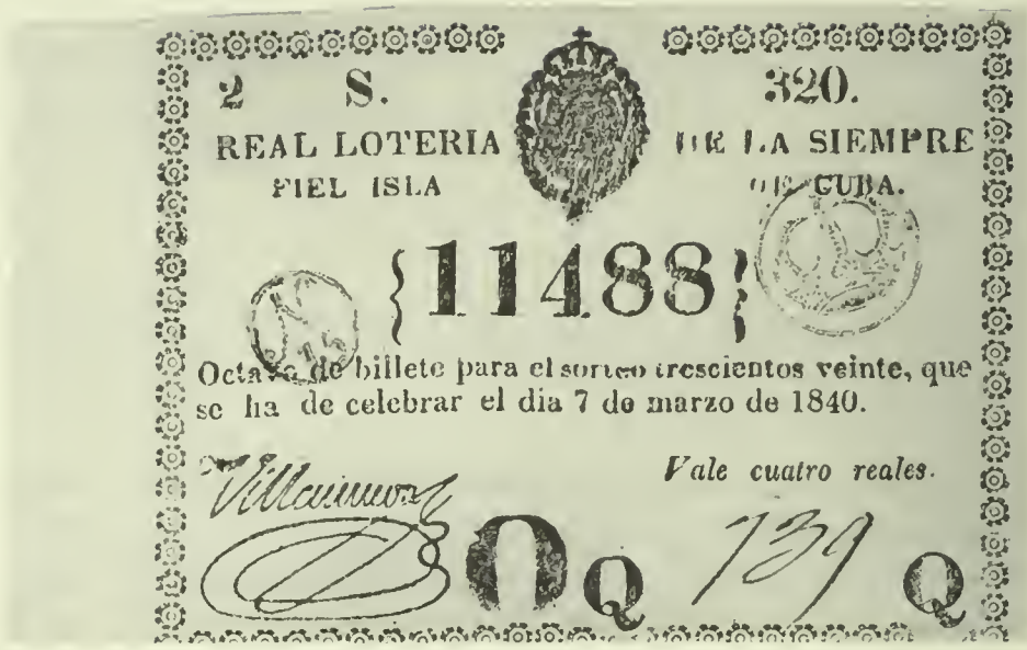
FIGURE 1.1 • Cuban lottery ticket, 1840. Private collection.

world when anticolonial movements in Europe's American colonies gave rise to new national states and the promise (if not the uniform practice) of liberal citizenship, Cuba did not experience revolutionary upheaval and, in fact, prospered greatly as a colony. Cuba's loyalty to Spain was not the outcome of the wishful thinking of the Spanish government, no matter how persistently it affirmed the ever-faithful island. Nor was repressive violence the lone explanation. That allegiance depended on the support of Cubans and on the pervasive ideas about race that shaped Cuban society.